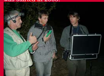
Fig.1. In workshops, volunteers and Regional Bat Experts were taught how to discriminate P. pygmaeus and P. pipistrellus with their heterodyne bat detector

But until the end of 2002, only 6 nursery colonies and 3 day roosts had been found in whole Switzerland. P. pygmaeus is expected to occur in more high potential areas within Switzerland. In these regions, more maternity roosts of P. pygmaeus need to be distinguished from its nearest relatives in order to protect the species accurately. As a consequence, a conservation project was started in 2003.